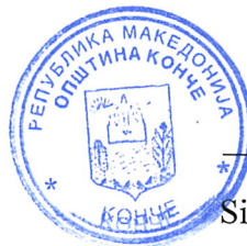
Signature, Mayor of Konce